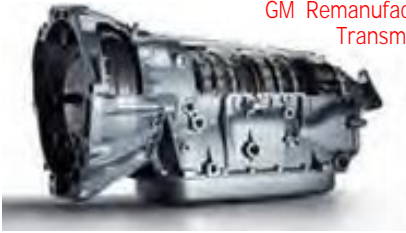
GM Remanufactured Transmission

Each GM Goodwrench remanufactured automatic transmission passes a series of rigorous tests before it goes into your GM vehicle. GM Goodwrench remanufactured transmissions are calibrated for your specific late-model GM vehicle to help maintain its original ride performance.