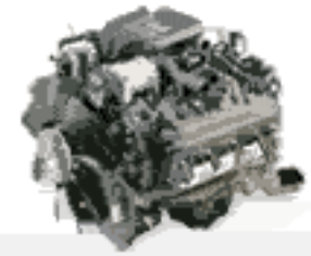
6.5L Diesel New & Rebuilt