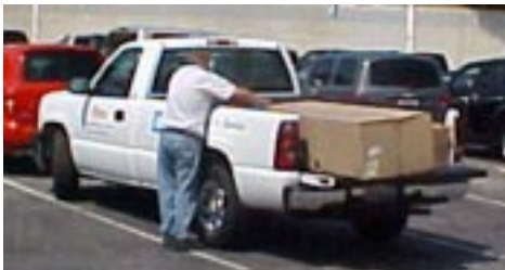
A parts shuttle rushes parts to near-by locations throughout the day.