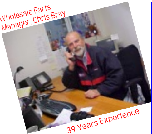
39 Years Experience