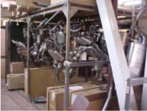
A huge inventory of parts guarantees rapid service

rounding area dealerships. Few parts departments at any dealership for any make of vehicle will take the next step that is common at Rydell : If that part is available at a remote location, even as far as Ventura, Riverside or San Bernardino, one of the dealer-to-dealer drivers will quickly be on the road to pick up that part for the customer.