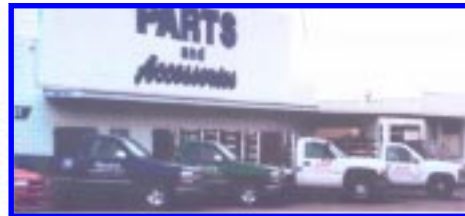
Just a few of our 5 dealer-to-dealer parts trucks and our 7 wholesale parts trucks.