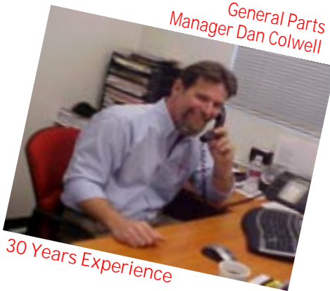
30 Years Experience